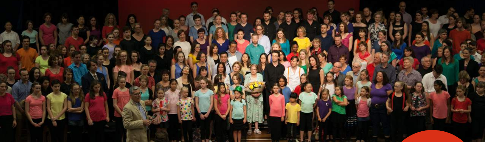
The participants of the Summer School Music Program, January 2018

EARLYBIRD REGISTRATION CLOSES: MONDAY 7th NOVEMBER 2022