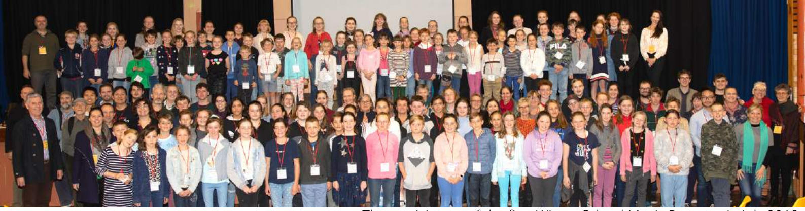
The participants of the first Winter School Music Program in July 2019